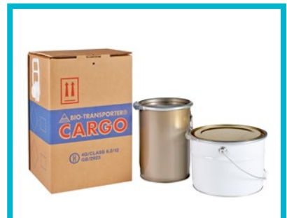
06 INFECTIOUS SUBSTANCE PACKAGING