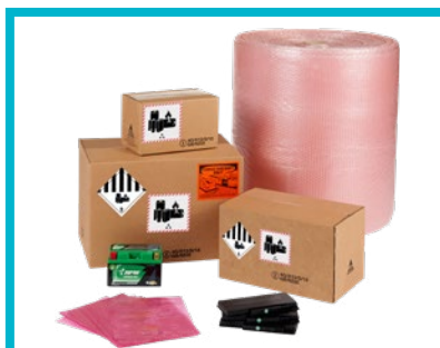
08 LITHIUM BATTERY PACKAGING