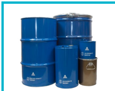
05 UN APPROVED SINGLE PACKAGING