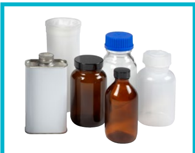
04 INNER PACKAGING