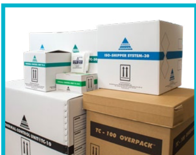
07 THERMAL CONTROL PACKAGING