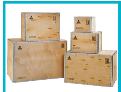
03 OUTER PACKAGING 4DV RANGE