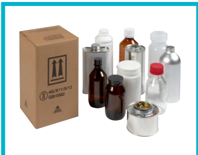
01 OUTER PACKAGING 4G RANGE