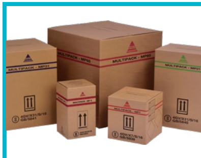
02 OUTER PACKAGING 4GV RANGE