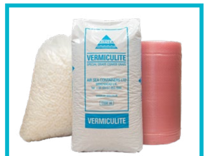
09 PACKAGING ESSENTIALS